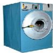
Average washing time with ozone laundering - Temps moyen de lavage à l'ozone 24 minutes