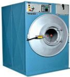
Average washing time with conventional detergents - Temps moyen de lavage avec les détergents conventionnels 47 minutes